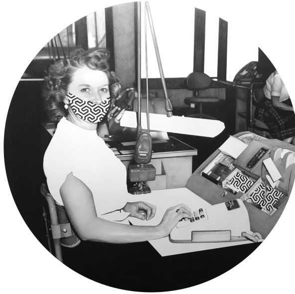
Punchcard VII Punchcard VIII