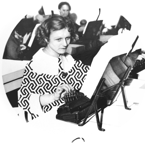
Punchcard Punchcard II