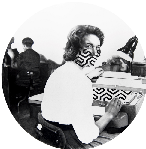
Punchcard V Punchcard VI