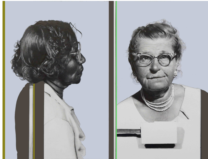
Incriminations VI Incriminations VII

2019 30 x 40 cm Pencil and acrylic on paper