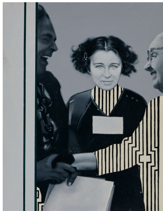
Interventions V Interventions VI