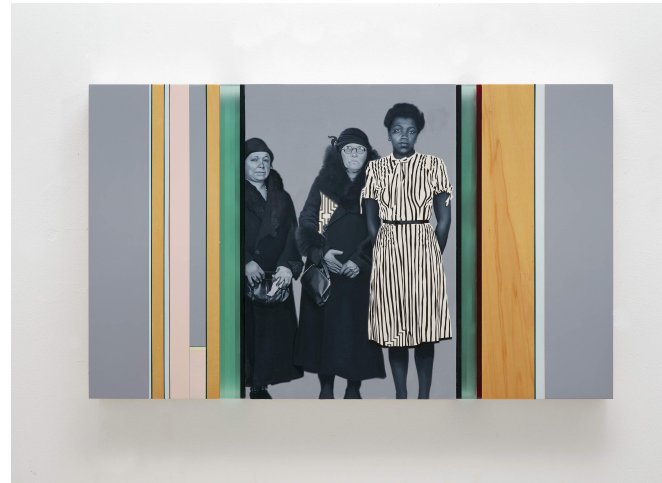
Interventions III Interventions IV

2019 60 x 100 cm Acrylic on wood/ aluminium with perspex