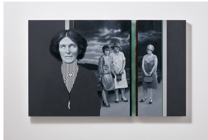
Interventions V Interventions VI

2019 60 x 100 cm Acrylic on wood/ aluminium with perspex