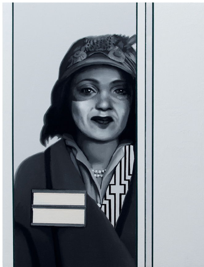
Interventions X Interventions XI