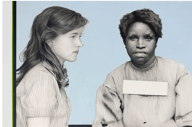
Incriminations III Incriminations IV

2017/18 30 x 40 cm Pencil and acrylic on paper